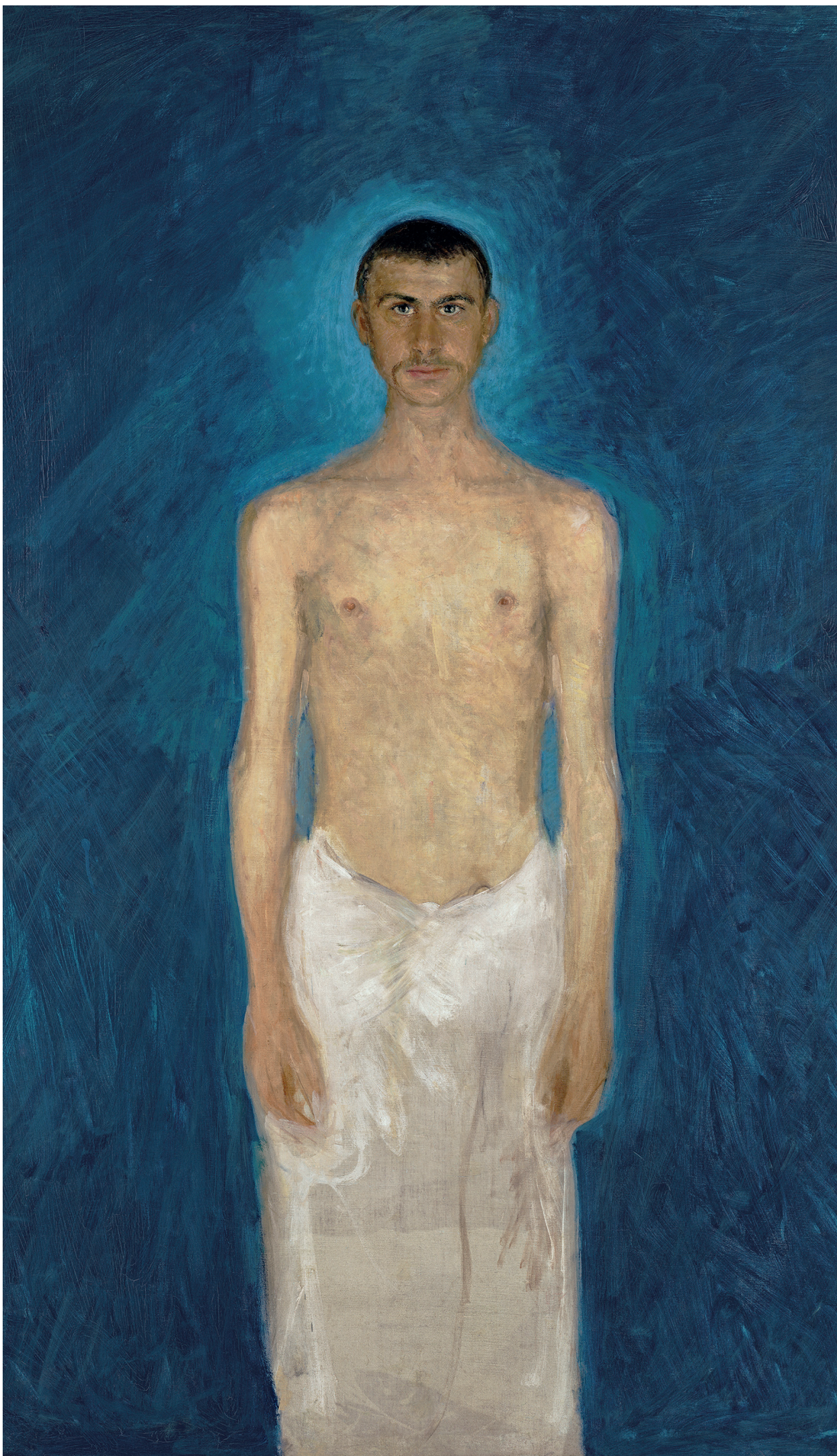
Richard Gerstl's "Semi-Nude Self-Portrait" (1902-04). The luminous blue color produces an aura, as though the artist is giving off light.

Richard Gerstl had an ill-fated affair, destroyed his work, then killed himself. By the way, you can now also see his paintings.