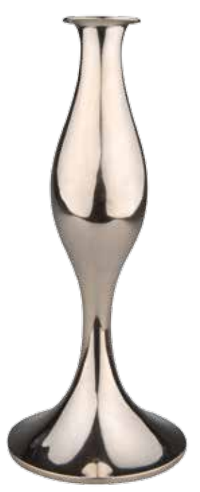
7. Vase, 1909, designed by Josef Hoffmann, silver, ht 24cm. MAK – Austrian Museum of Applied Arts/Contemporary Art, Vienna

Some of the Werkstätte's most beautiful and successful designs fell outside even the broadest commissions of the palace or the theatre. The firm's fashion designs and jewellery were, in a way, their most successful pieces. The brooches designed by Hoffmann were jewelled equivalents of Klimt's canvases, works which blended representation and abstract pattern, in which gems became colour-field blocks and cabouchons were transformed into tiny fruit (Figs. 1-4). The dresses bordered on architecture, applied with the black and white geometric frames used in the buildings and sometimes leavened by Klimt-like explosions of colour (Fig. 9). The metalwork, in particular, seem to predict future developments. Some of Hoffmann's hammered bonbonnières and vases, for instance, look like bourgeois, table-top versions of brutalist buildings (Figs. 8 & 10). Other designs, like Hoffmann's hourglass vase (Fig. 7) and Pavel Janák's waisted and striped vase, point to pure mid-century modern.