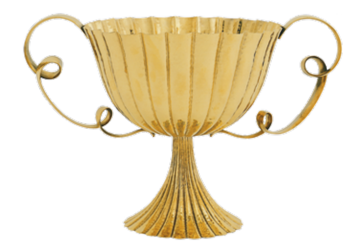
Fig. 10 photo: Hulya Kolabas, New York / Fig. 12 photo: Georg Mayer; @ MAK, Vienna