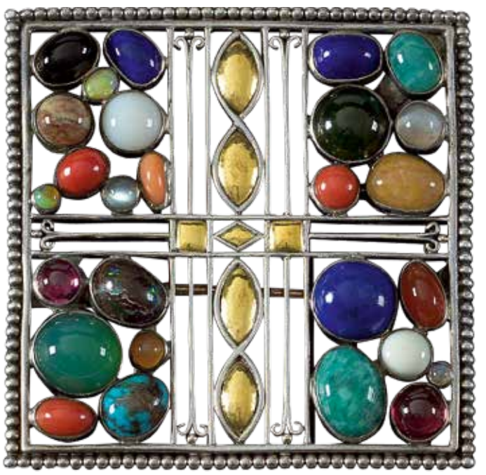
2. Brooch, 1908, designed by Josef Hoffmann, silver, partly gilt, agate, almandine, chrysoprase, carnelian, coral, lapis lazuli, moonstone, opal, turquoise. Private collection