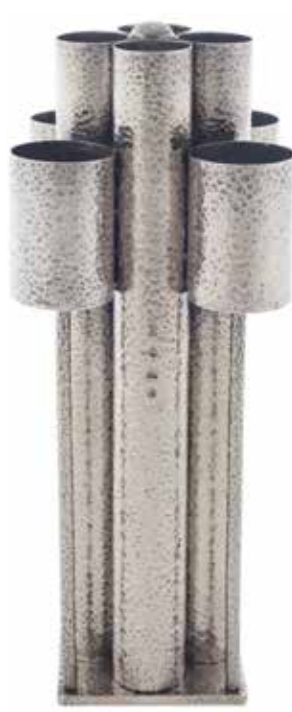
8. Vase, 1905, designed by Josef Hoffmann, silver-plated metal. Private collection