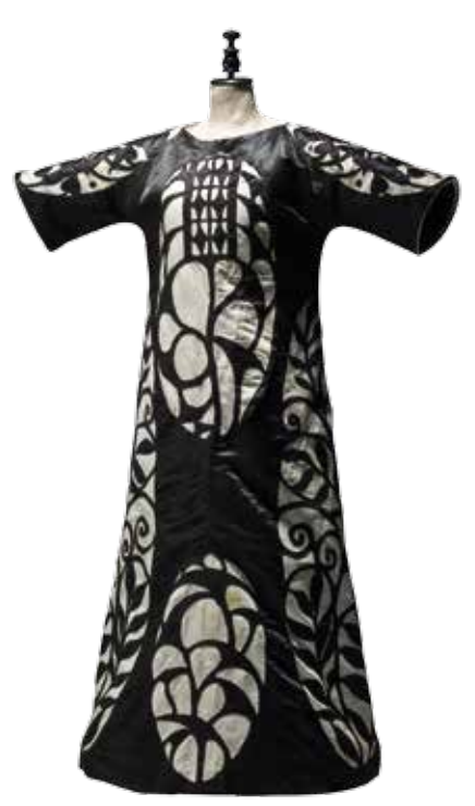
9. Ball dress, c . 1910, designed by Josef Hoffmann, cotton, silk, and satin, ht 145cm. MAK – Austrian Museum of Applied Arts/Contemporary Art, Vienna