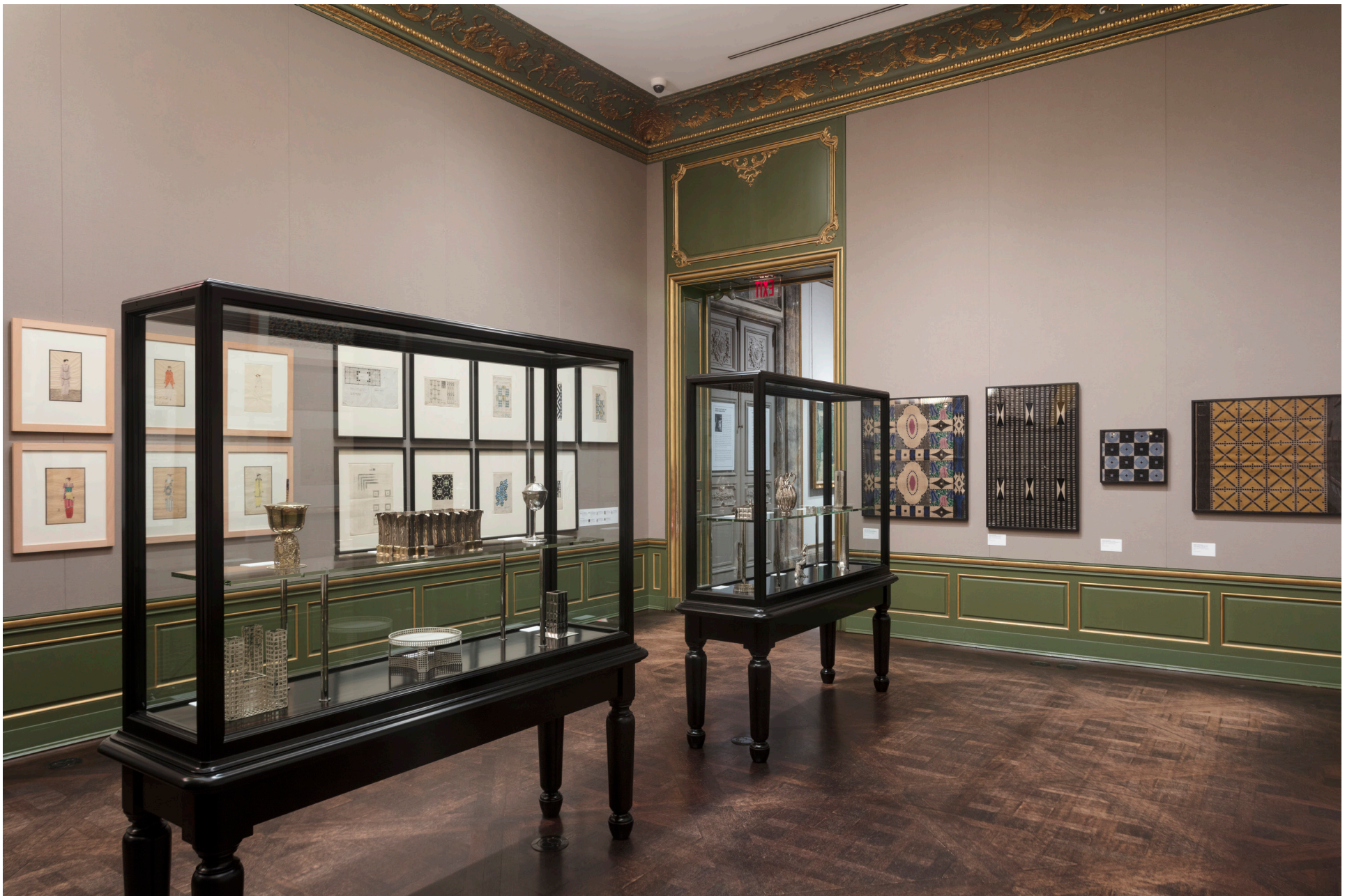
An installation view of objects and designs from the Wiener Werkstätte. Neue Galerie, New York